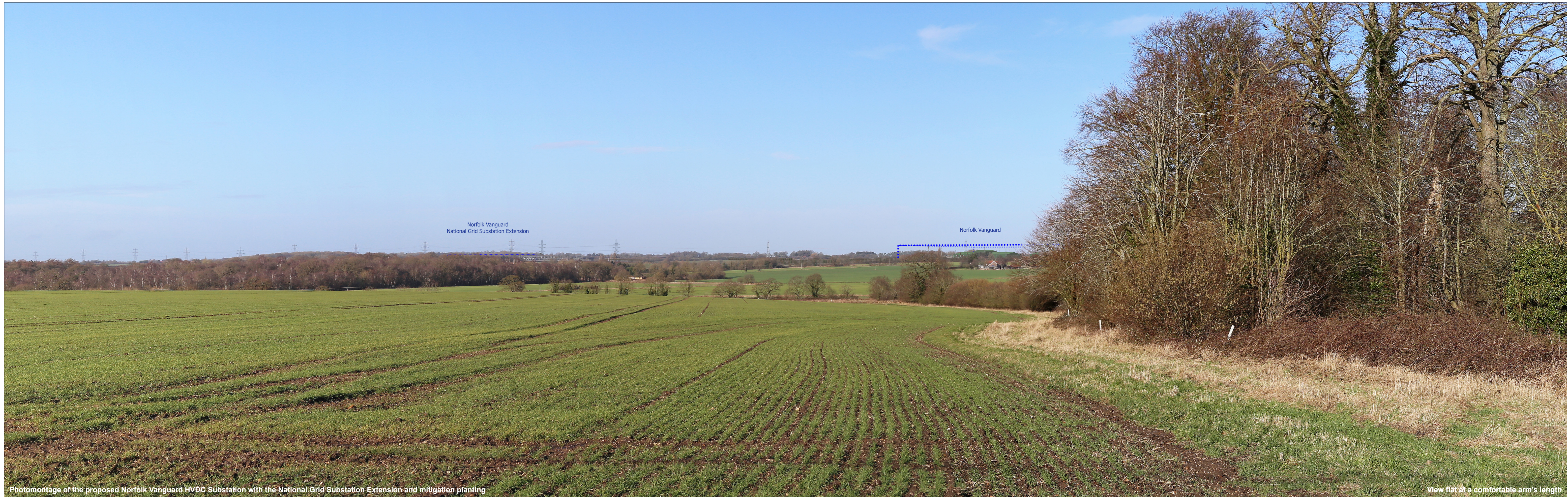
Photomontage of the proposed Norfolk Vanguard HVDC Substation with the National Grid Substation Extension and mitigation planting