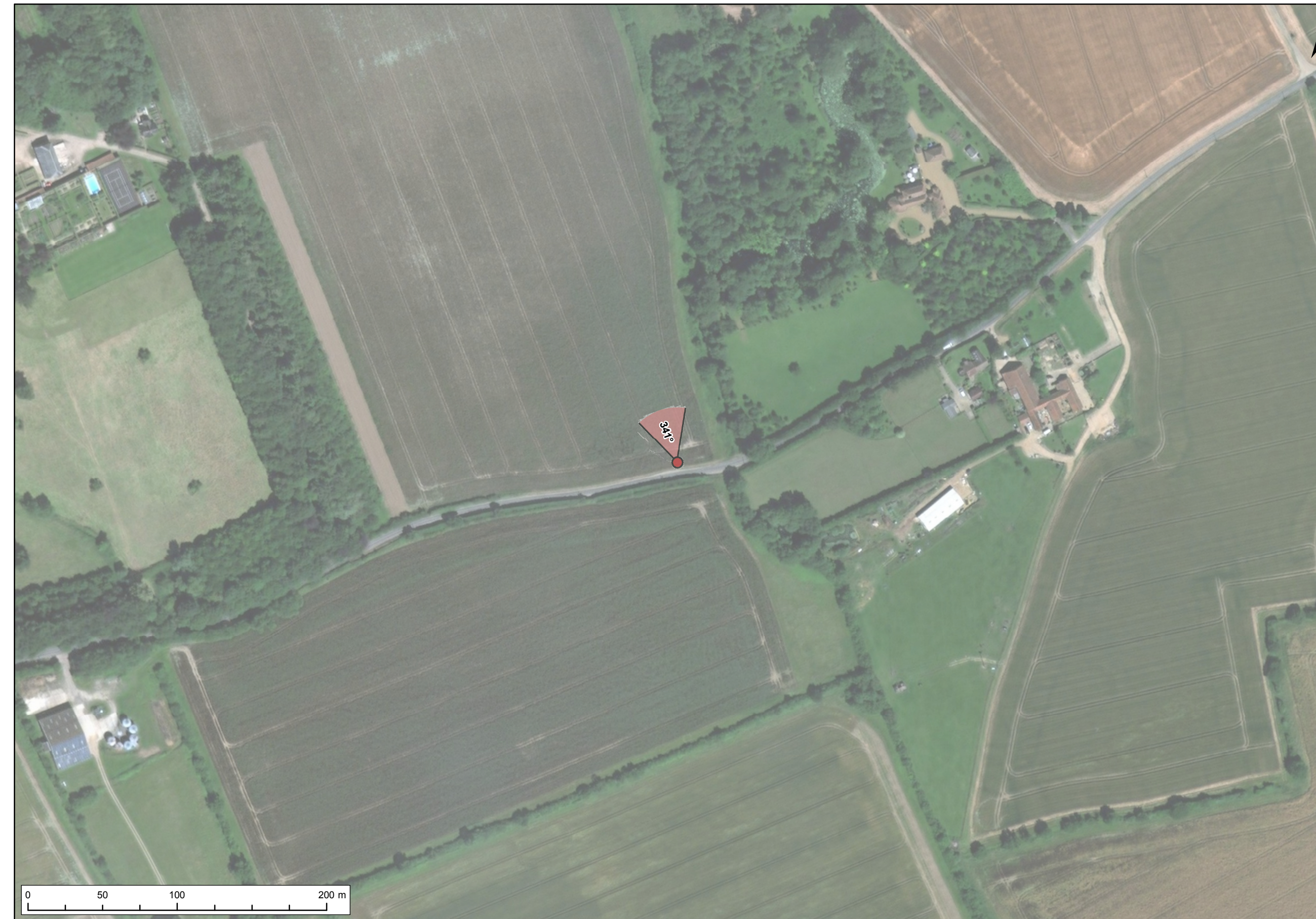
Viewpoint Location Plan: 53.5 Degree View Scale: 1:2,500