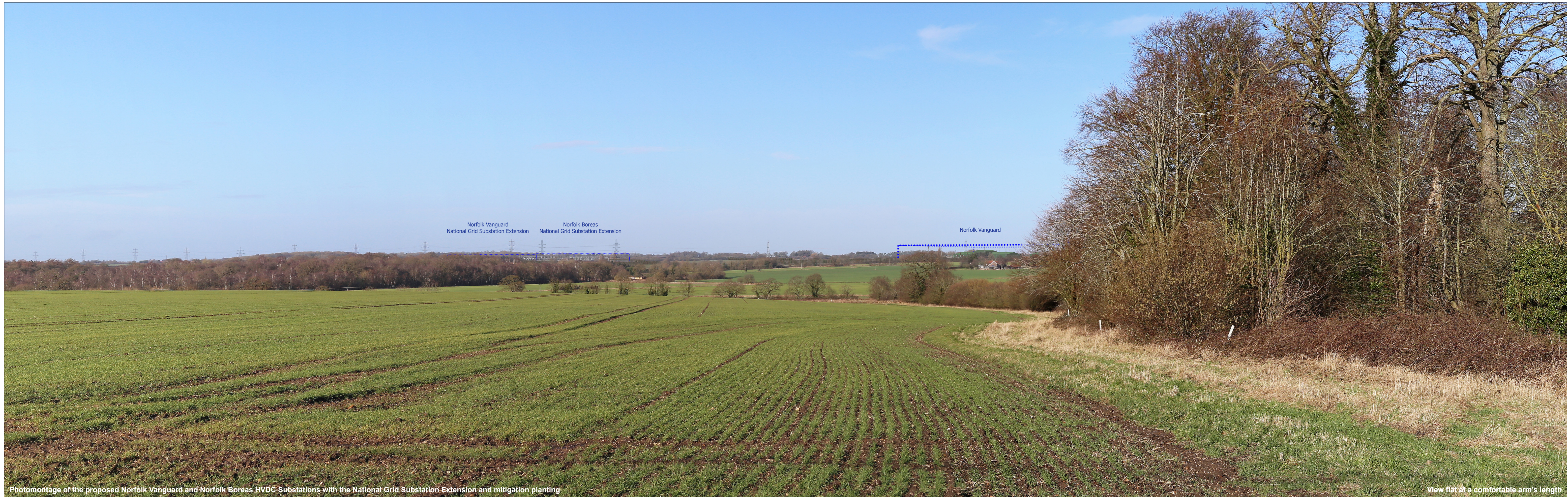
Photomontage of the proposed Norfolk Vanguard and Norfolk Boreas HVDC Substations with the National Grid Substation Extension and mitigation planting